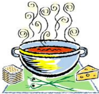
Soup & Sandwich Luncheon

The Youth Mission Trip team will host a Soup and Sandwich Luncheon on Sunday, February 1, following the 10:30 service to raise money for their trip to Lodi, Ohio.